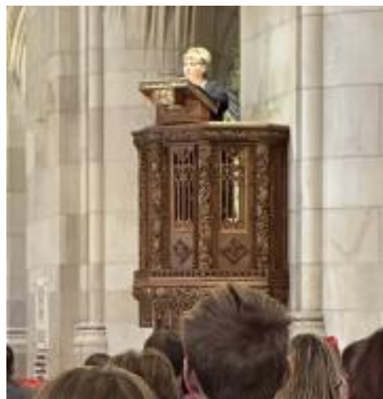
Confirmation Mass. Congratulations and prayerful wishes to all on this important event in their life!